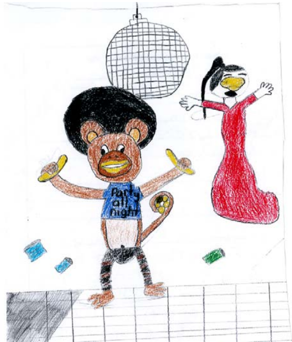
Entry from Whalan Public School (NSW) 9 Years Old