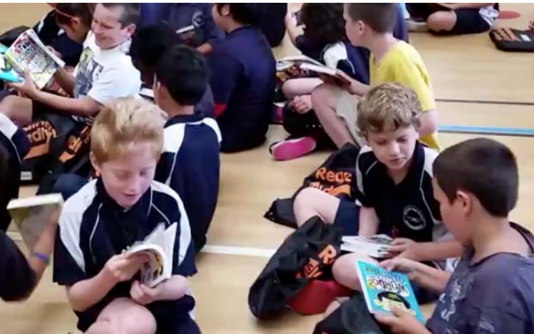
Students from Elizabeth Vale Primary School enjoying their new books! Sponsored by Universal Charitable Fund